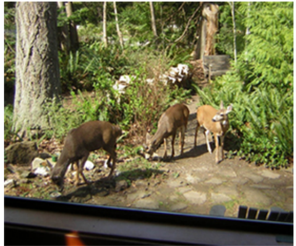
Visitors to one of our offices